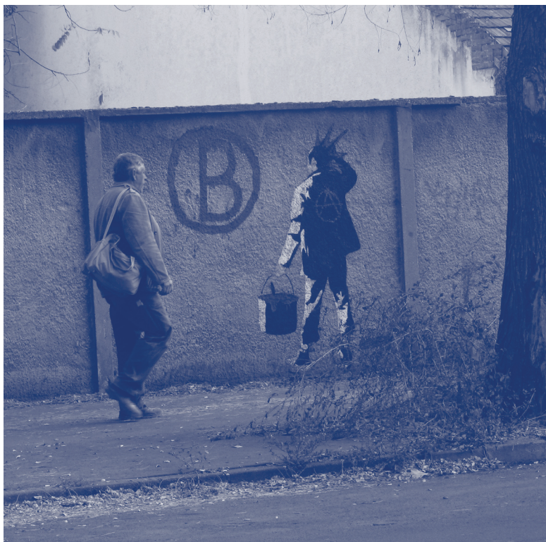
HUNGARIAN DOUBLE-TAILED DOG, PUNK , 2008, stencil graffiti. ▲